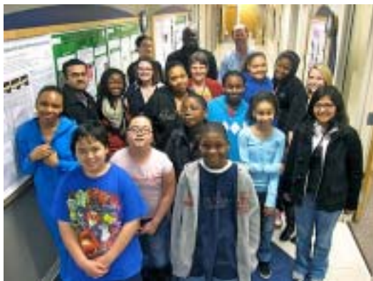
Students, teachers and mentors of the McCormick Boys and Girls Club toured NURERC and learned about prosthetics and rehabilitation engineering.